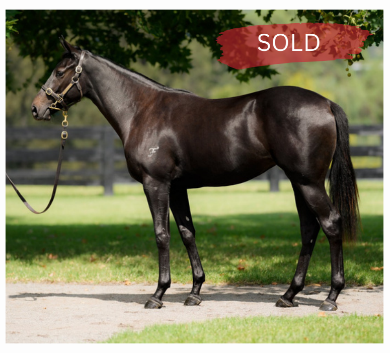
Lot 465 Pierro x Comaneci