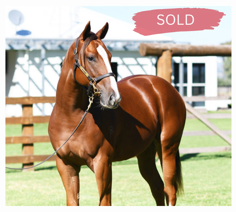
Lot 192 Capitalist x Oh My Mimi

In recent seasons fillies purchased from this sale have included stakes performers, Illumination, La Bella Beals, Dubai Diva, Merchant Queen and Moet Down. These five stakes' performers are from only seven fillies purchased over the past three years in Australia. We are thrilled to add a stunning colt to this years purchases, lot 165. He is out of the champion More Than Ready mare More Joyous, who boasts eight Group 1 victories across her 23 win career and the title of Champion Middle Distance Horse in Australia in 2011-12 and we believe could make an excellent stallion prospect!