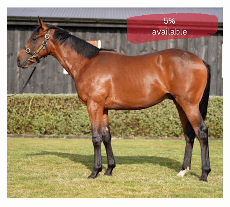
Lot 22 Kings Legacy x Lady Iveagh

There was a lot of quality to be had at this years online sale and we were extremely pleased with the value purchases we secured which has been reflected in their popularity with only two small shares remaining!