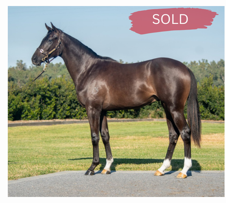
Lot 165 So You Think x More Joyous