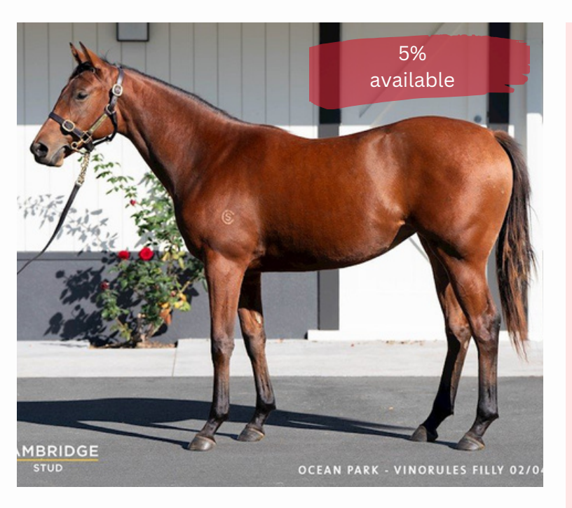
Lot 83 Ocean Park x Vinorules