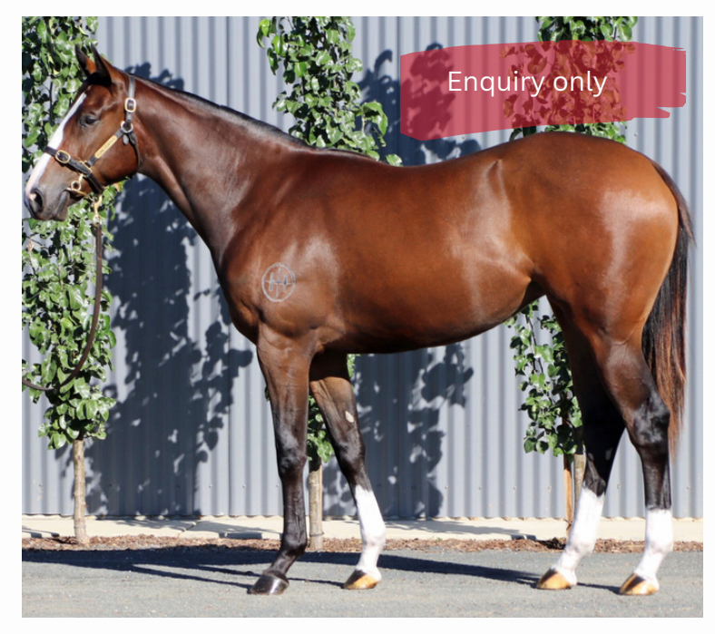
Lot 363 Russian Revolution x Twelve Pack Shelley