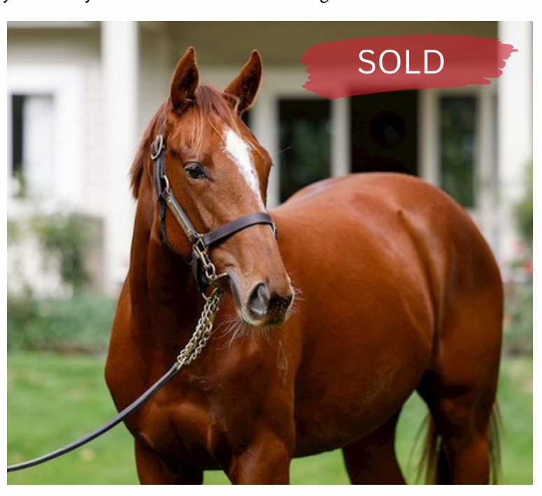
Lot 36 Written Tycoon x Mozzie Monster