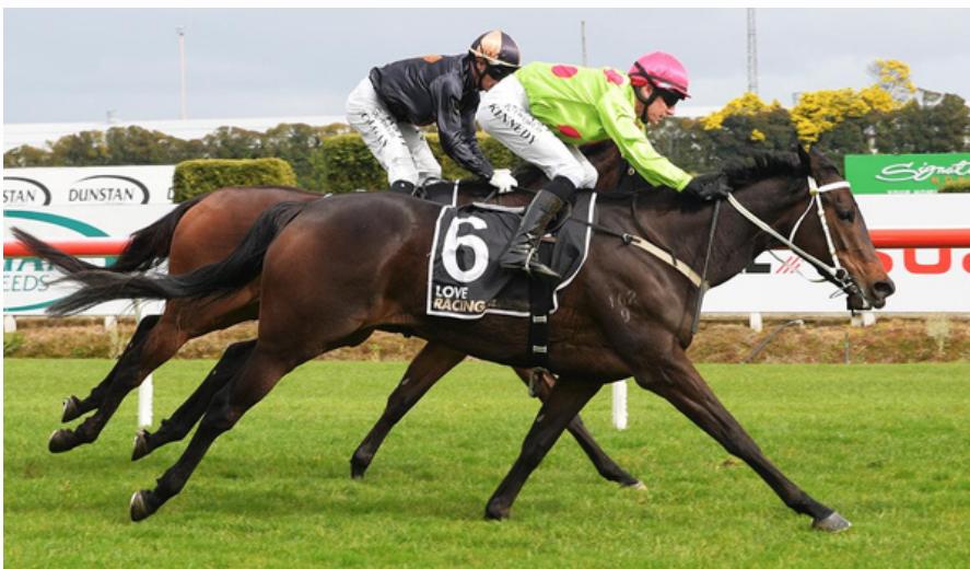
12/08/23 Te Rapa