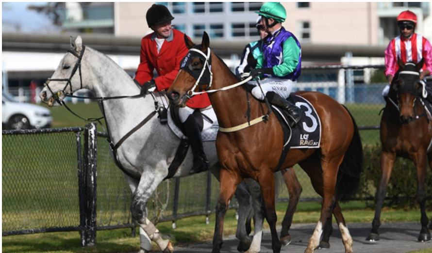
12/08/23 Te Rapa