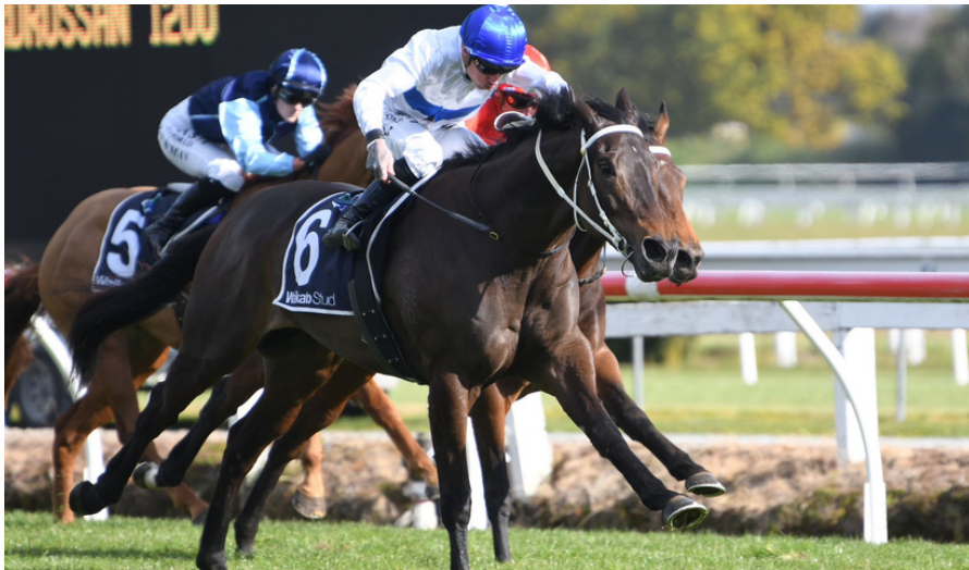
26/08/23 Te Rapa