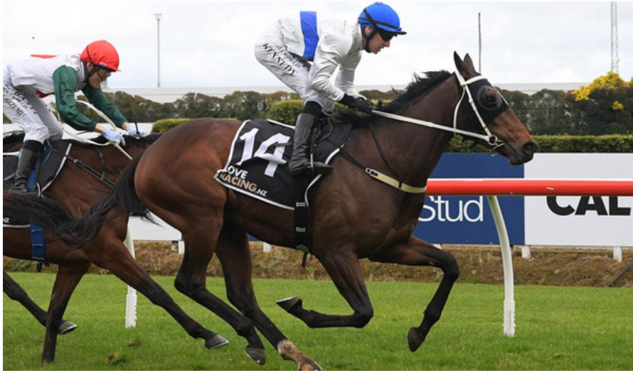
12/08/23 Te Rapa