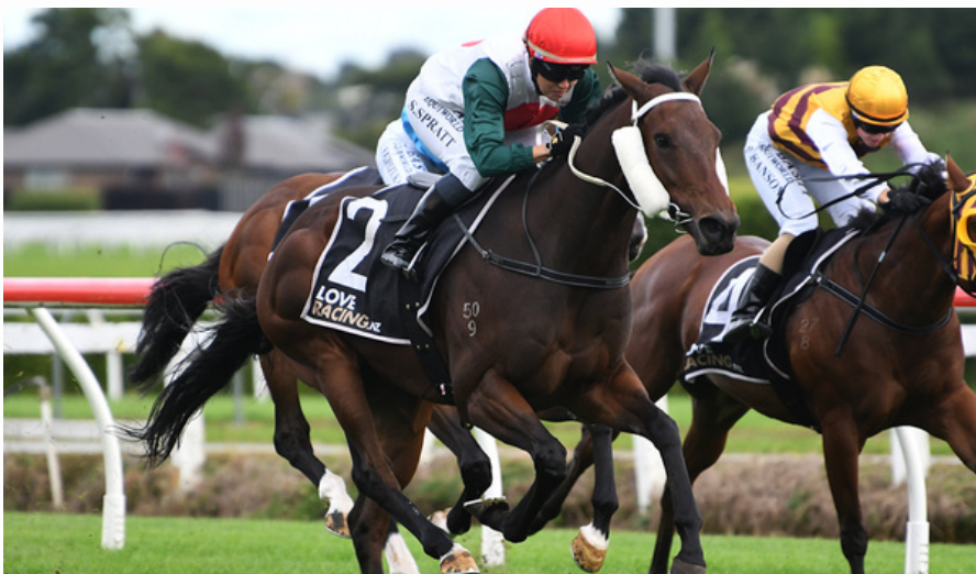
15/04/23 Te Rapa