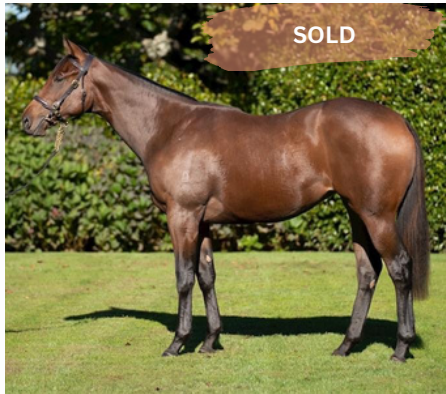
Lot 2 Embellish x Anahita

We purchased two fillies from the NZB online sales and are pleased to say both sold completely in a matter of days. Lot 2, a filly by Embellish who has made a strong start to his career as a sire and lot 54, a filly we thought was very mature, had good natural strength and an excellent temperament. We look forward to them being broken in and their promising futures.