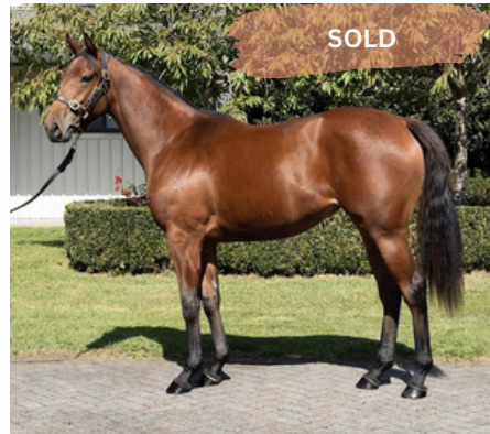
Lot 54 Reliable Man x Odisha