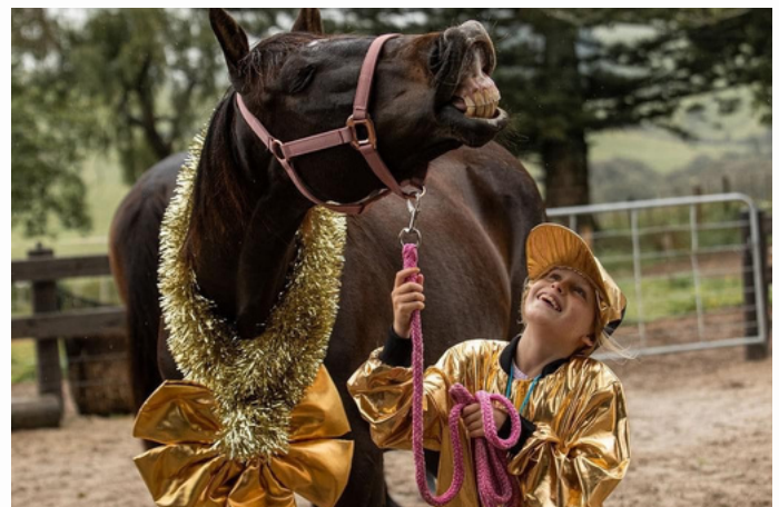
Sexabeel clearly enjoying himself!

Between holiday camps and school programmes, the horses are kept stimulated and cared for while at the same time helping children with building confidence, teamwork and communication skills.