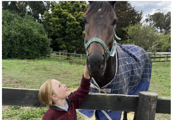
Ash settling into Christchurch

While he hasn't been off the track long it seems like he is taking to his new role extremely well!