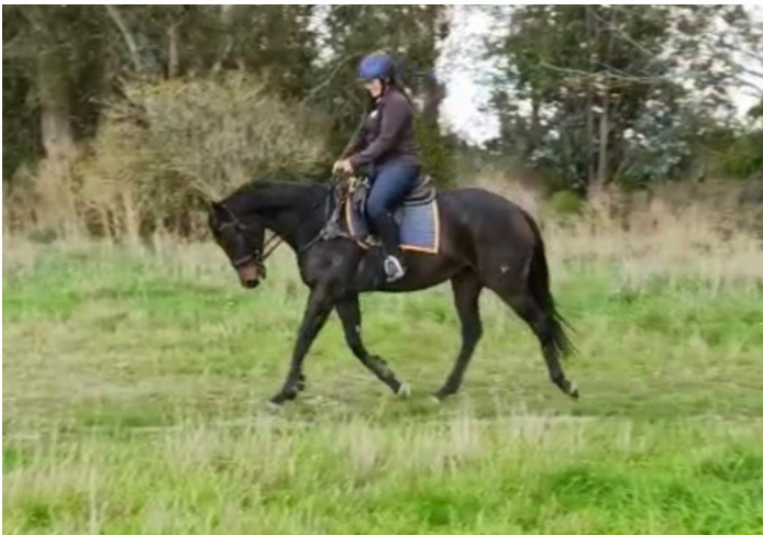
Ted looks pretty professional already

We caught up with some of the horses who were recently rehomed through Eventstars to see what they're doing now!