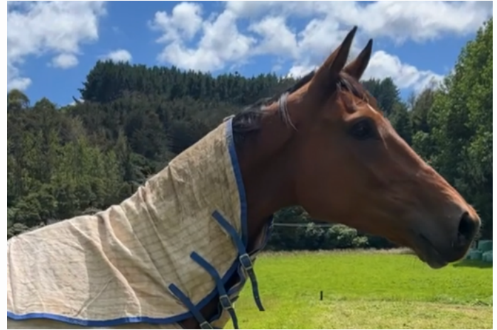
Handsome Bourbon in his new home