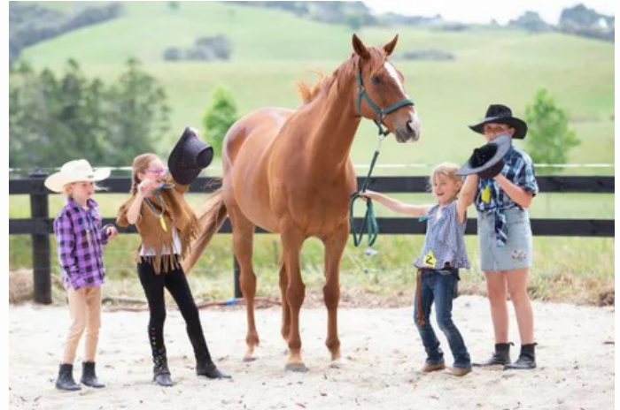
Seize The Moment at the Annarehab summer show