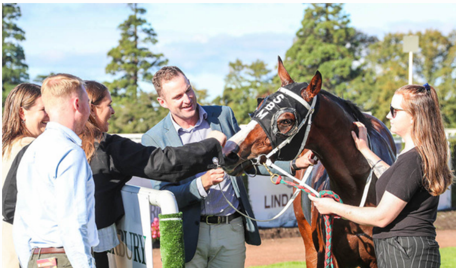
22/04/23 Riccarton Park