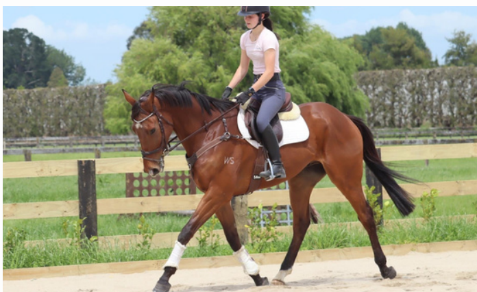
Sacred Bourbon at Eventstars