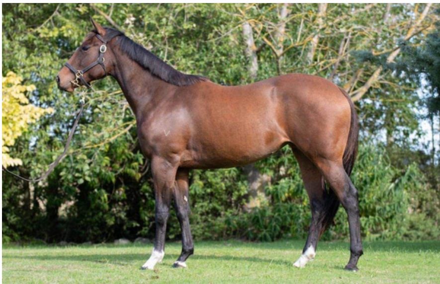
2YO War Decree x Kingsley Rose Filly