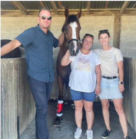
The team says farewell

Listed Timaru stakes winner and ever consistent mare Monza Circuito bowed out with a typically brave 2nd in the Timaru Cup on the 28th of Jan to add further black type to an impressive resume. Since joining our stable, “Monza” has become a stable favourite and a leading performer from our South Island barn. Having been covered by Ribchester the Timaru Cup was her last run and she retires with a record of 7 wins, 16 minor placings and over $230,000 in Prize Money. Raced by a great group, we look forward to seeing her progeny in the coming years.