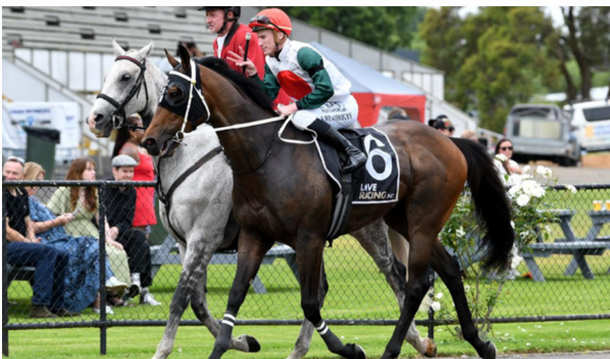
17/12/22 Te Rapa