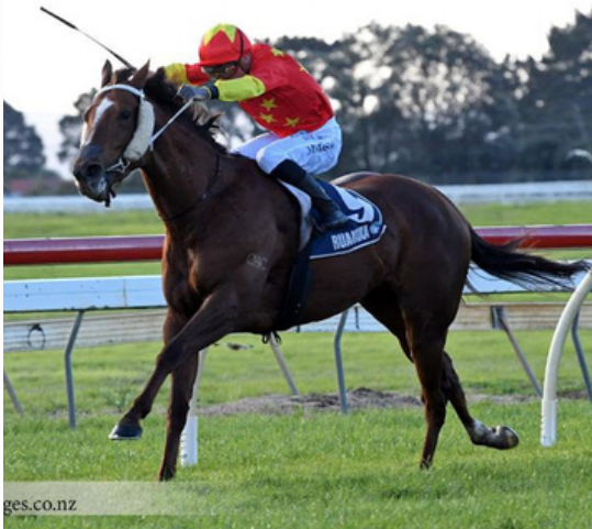
Oseleta winning at Ruakaka earlier this year

Four-time winning mare Oseleta finally secured valuable black type with an eye catching 3rd in the Manawatu Challenge stakes behind Darci La Bella and Coventina bay. The well-bred Deep Field mare is bred and raced by China Horse Club and has been a model of consistency throughout her 21 starts to date. With her value now secured as a broodmare, we look forward to going one better over the remainder of the season.