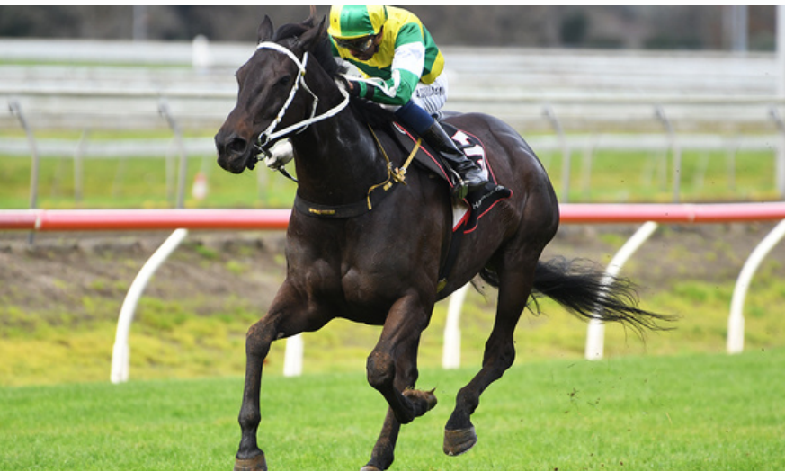
21/06/23 Pukekohe Park