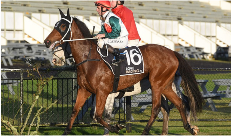
117/06/23 Te Rapa