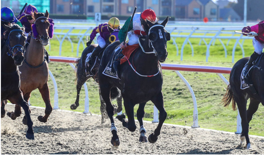
2/06/23 Riccarton Park