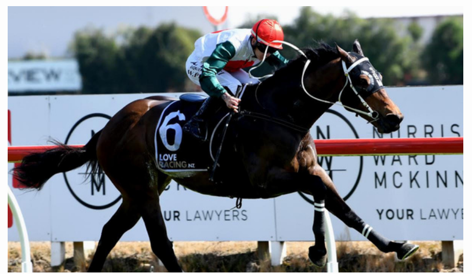
22/10/22 Te Rapa