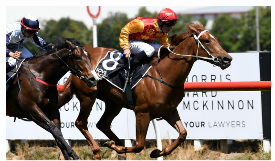
22/10/22 Te Rapa