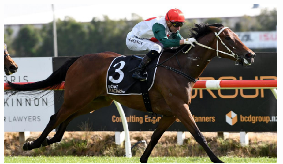
22/10/22 Te Rapa