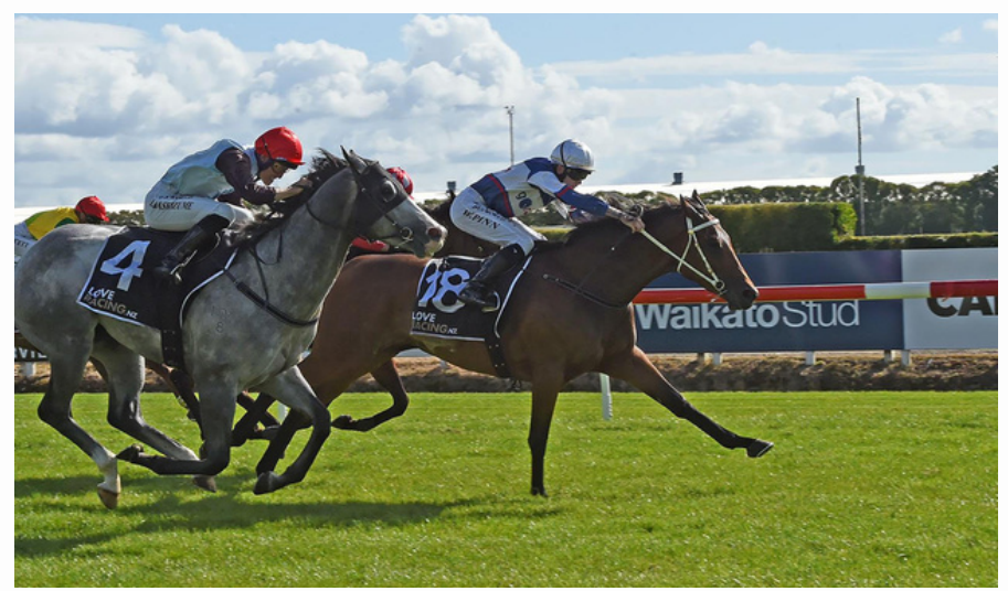
26/11/22 Te Rapa