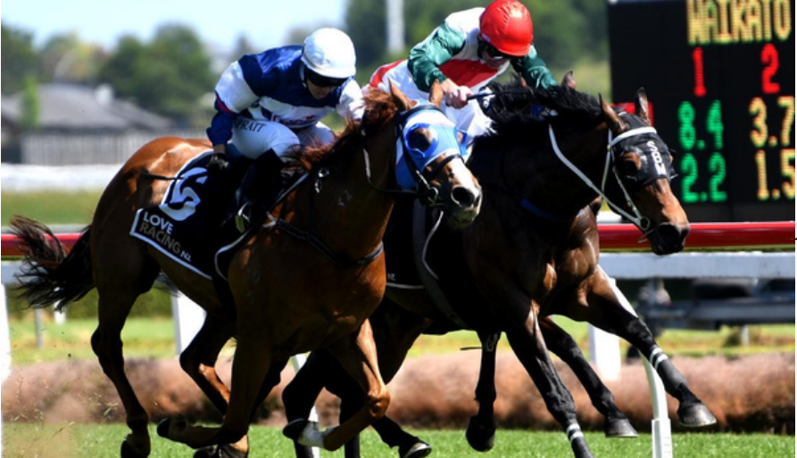
5/11/22 Te Rapa